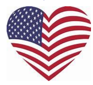
God Bless America! Land of the Free and the Home of the Brave!

Note : There will not be a parade, Fun Monday or Fun Sunday.